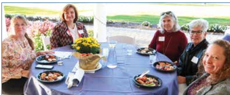
Event attendees enjoy the festivities.