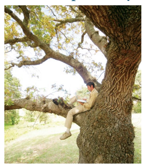
Your e-mail address allows us to share Charter Oak news with you regardless of where you hang out!

Charter Oak and its Alumni Association currently maintain e-mail addresses for a majority of nearly 12,000 alumni. E-mail allows us to communicate news of interest to our graduates more frequently than is possible through this Connections newsletter that is published twice annually. Our e-mail database is fully protected and is used only to communicate with alumni. If you have recently established a first time e-mail address or changed your old e-mail designation and would like to share it with us, please let us know by visiting www.CharterOak.edu/update