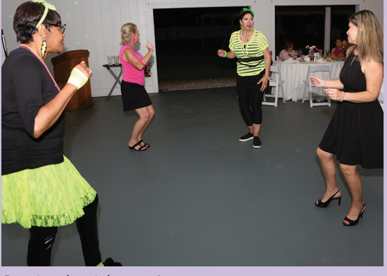
Dancing the night away!