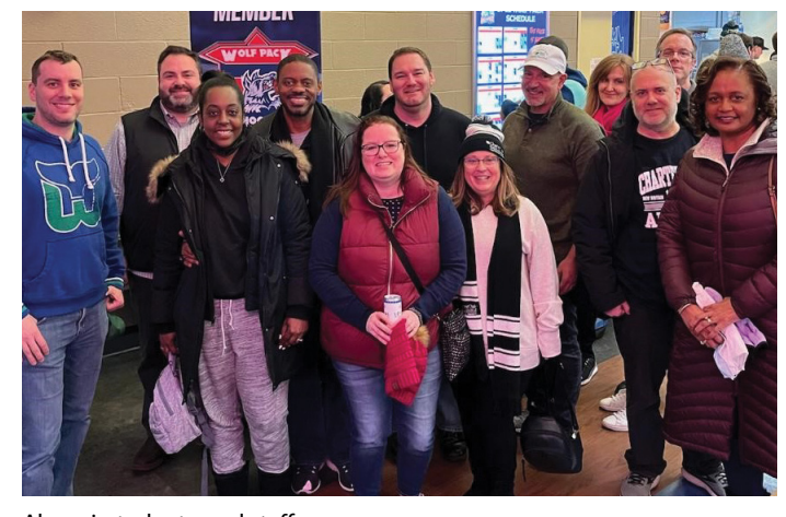
Alumni, students, and staff.

The evening included reserved group seating, the opportunity to network and connect, free swag for attendees, and of course, a hockey game! Hockey & Higher Education as it was named, raised $482 towards the Alumni Association Master's Degree Scholarship Program.