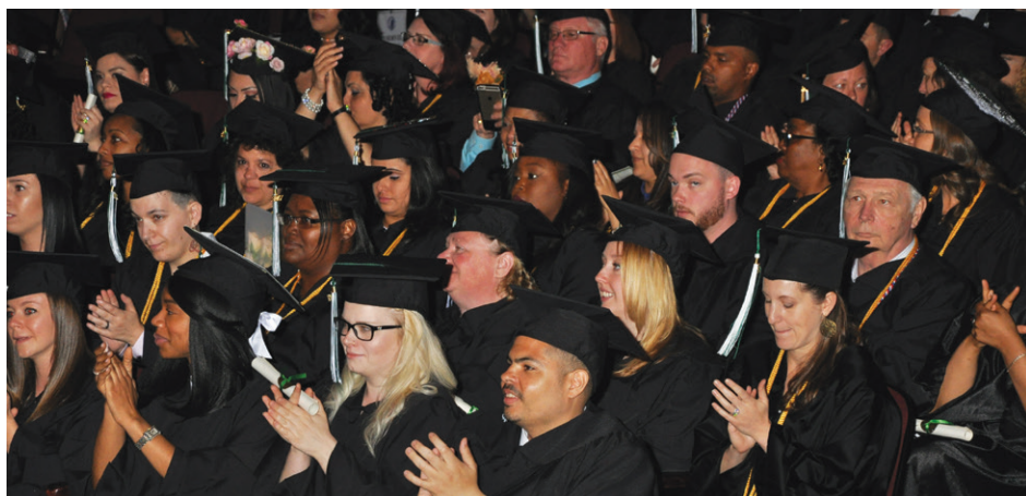
"2017 Commencement: Getting Involved" continued from pg. 2

opportunities in new directions" and encouraged all to "firmly and confidently embrace change, this is the inescapable yet promising reality we face as we walk out of the auditorium today."