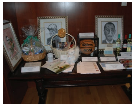
Auction items donated to the Spring Fundraiser.

The Charter Oak Foundation Board extends appreciation to all the participants, speakers, and sponsors.