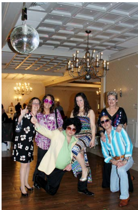
The disco and dancing theme was enjoyed by many!