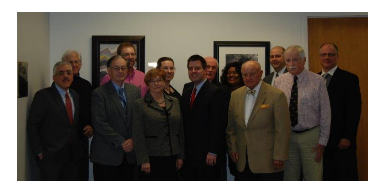
Charter Oak State College Foundation Board of Directors

The Charter Oak State College Foundation is dedicated to supporting flexible and comprehensive degree completion opportunities for adults, and technology innovations through the work of Charter Oak State College and the Connecticut Distance Learning Consortium. The Foundation is a vehicle for accepting private gifts, donations and bequests for activities that are not adequately funded by the State. The Foundation Board of Trustees provides volunteer leadership for development and fundraising programs and stewardship of the Foundation's assets in order to assist deserving and underemployed adult students with college costs; award scholarships; and encourage technological initiatives that enable the College and the Consortium to be leaders in higher education.