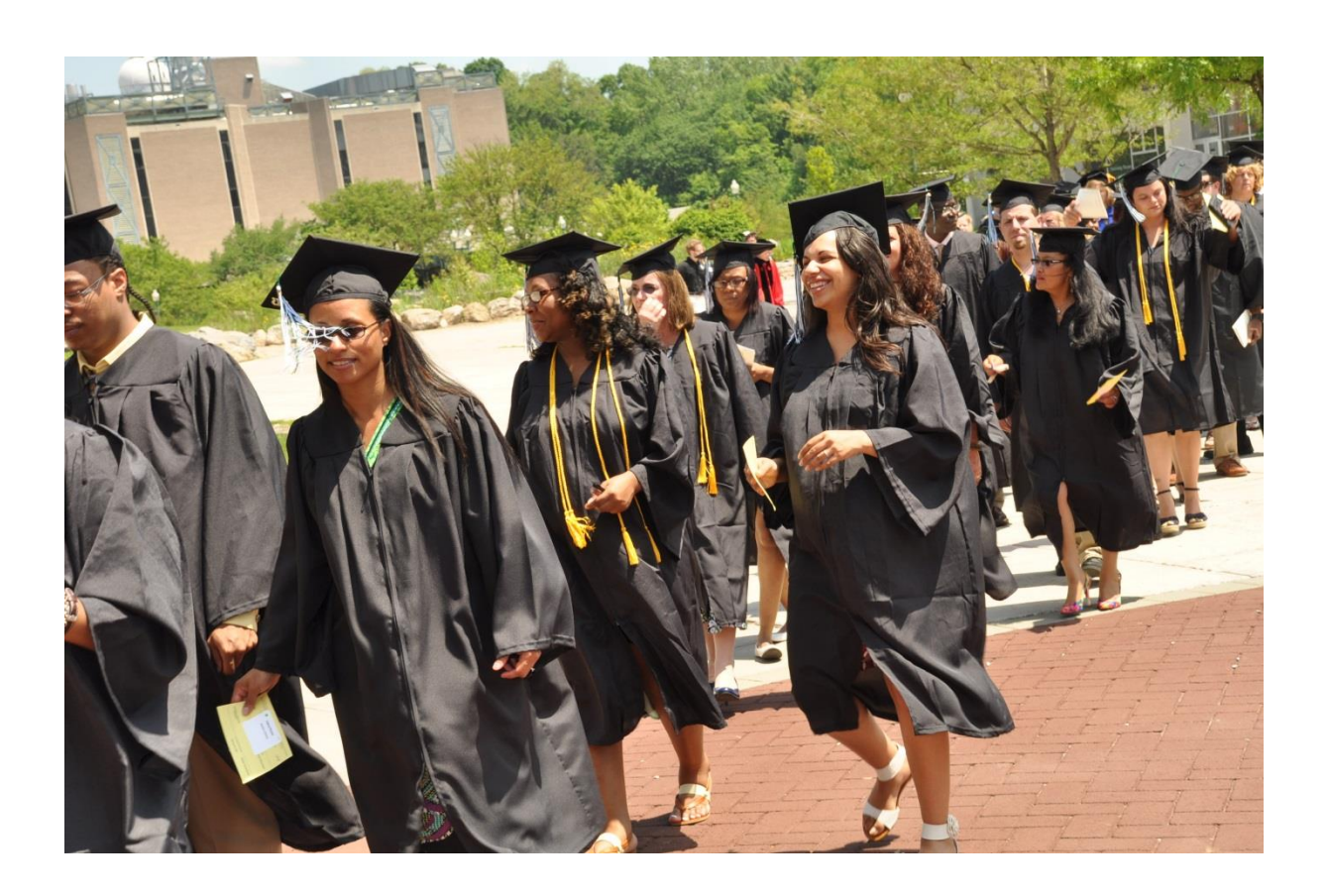
Charter Oak State College Graduation – June 2013

At Charter Oak we believe in empowerment through education. We are incredibly proud of the highlights mentioned in this report, which are but a few of the achievements of the past year. This progress would not have been possible without the extraordinary financial support provided to the Foundation by donors who believe in the purpose and mission of the College. We are extremely grateful for the financial contributions, large and small, that have made it possible for numerous students to reach their academic potential and goals. Charter Oak State College is a dynamic community of online learners advancing the workforce one graduate at a time .