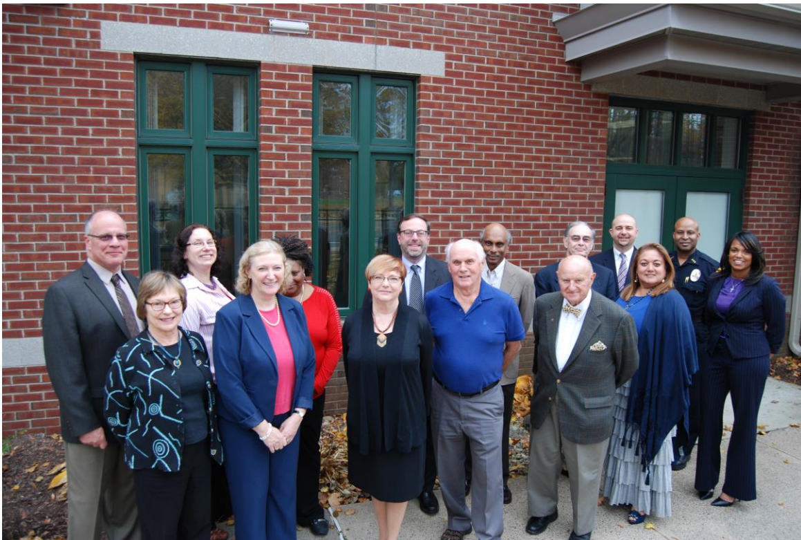
Charter Oak State College Foundation Board of Directors

The Charter Oak State College Foundation is dedicated to supporting flexible and comprehensive degree completion opportunities for adults, and technology innovations through the work of Charter Oak State College and the Connecticut Distance Learning Consortium. The Foundation is a vehicle for accepting private gifts, donations and bequests for activities that are not adequately funded by the State. The Foundation Board of Trustees provides volunteer leadership for development and fundraising programs and stewardship of the Foundation's assets in order to assist deserving and underemployed adult students with college costs; award scholarships; and encourage technological initiatives that enable the College and the Consortium to be leaders in higher education.