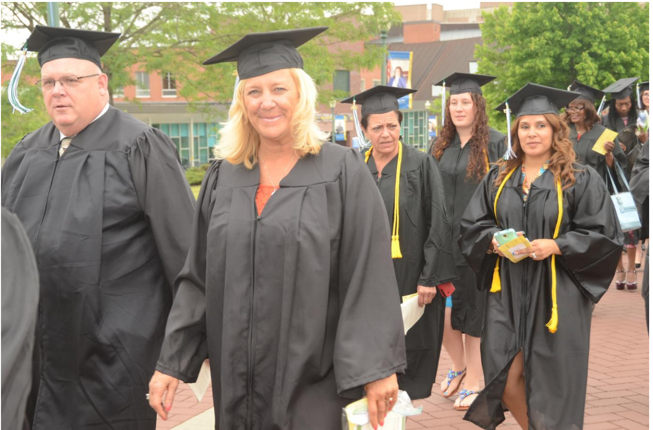
Charter Oak State College Graduation – June 2015

At Charter Oak we believe in empowerment through education. We are incredibly proud of the highlights mentioned in this report, which are but a few of the achievements of the past year. This progress would not have been possible without the extraordinary financial support provided to the Foundation by donors who believe in the purpose and mission of the College. We are extremely grateful for the financial contributions, large and small, that have made it possible for numerous students to reach their academic potential and goals. Charter Oak State College is a dynamic community of online learners advancing the workforce one graduate at a time.