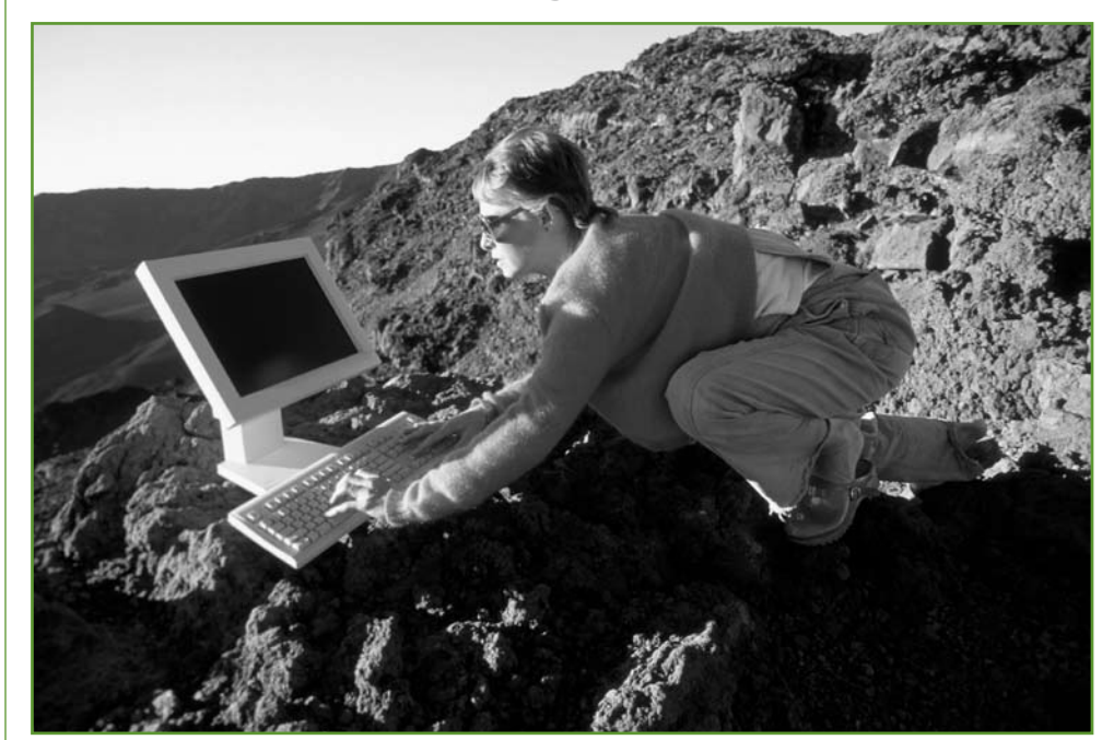
Your email address allows us to share Charter Oak news with you wherever you are.

harter Oak currently maintains e-mail addresses for a vast majority of its nearly 10,000 alumni. E-mail allows us to communicate news of interest to our graduates more frequently than we are able to through this Connections newsletter which is published twice annually. Our e-mail database is fully protected and is used only to communicate with alumni. If you have recently established a first-time e-mail