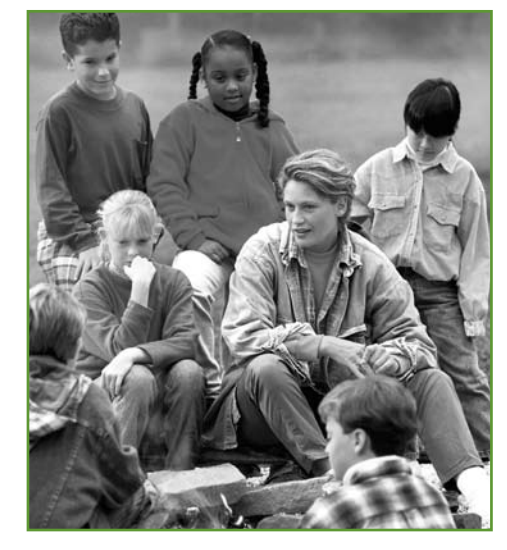
The need for applicable college level coursework for after school providers in Connecticut is clear and compelling.

After school professionals enjoy taking these Charter Oak online courses because they validate their work with children and youth and provide the skills and knowledge that improve the quality of care they provide. As