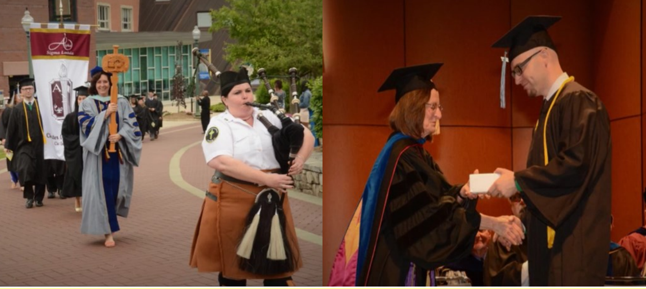
Congratulations Class of 2017!

- UPDATE SUMMER 2017 -*Chart STATE G Degrees With DREAMED